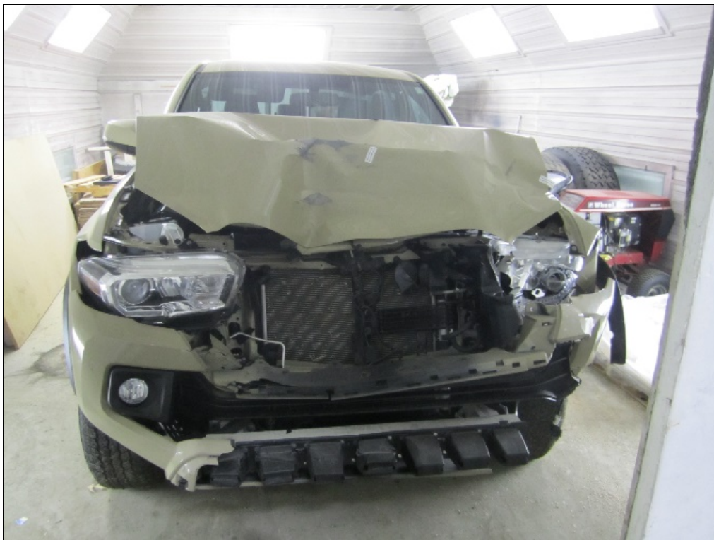
Figure 6. Frontal damage to pickup truck.

Figure 6 shows the damage the pickup truck sustained during the collision. The leading edge of the hood was displaced rearward, and the center was arched upward. The grille and much of the front bumper covering were missing. The hood was indented to the right of the left headlamp assembly. The left headlamp assembly was crushed. The left front fender was displaced rearward, and the trailing edge of the left fender was contacting the driver's door. The right headlamp assembly was displaced from its mounting location but remained attached to the vehicle. According to photographs taken at the crash site, the headlamps were working after the crash.