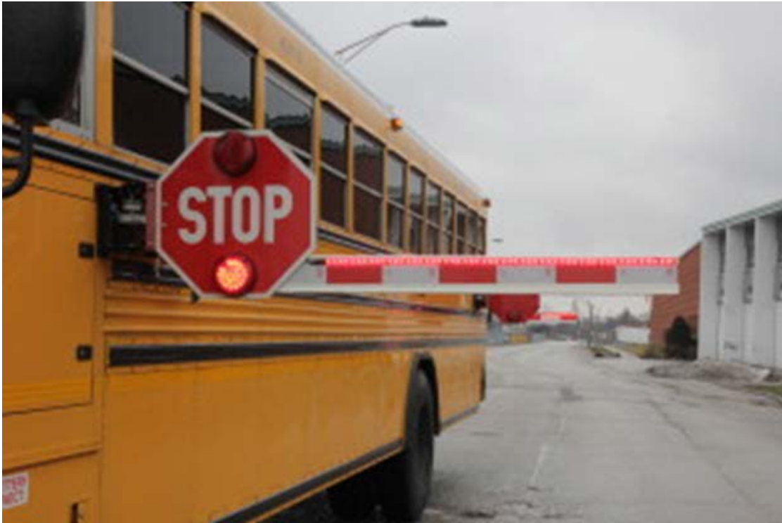
Figure 9. Close-up view of extended stop arm with single stop sign and horizontal stop bar.

Another new technology is the predictive stop arm. This safety feature uses radar technology and predictive analysis to monitor traffic approaching the school bus from either direction to assess the likelihood of illegal passings. 67 Each oncoming vehicle's speed, location, and acceleration/deceleration are used to determine whether the vehicle is likely to stop. When a risk is detected, the predictive stop arm provides an audible warning to the students and the bus driver.