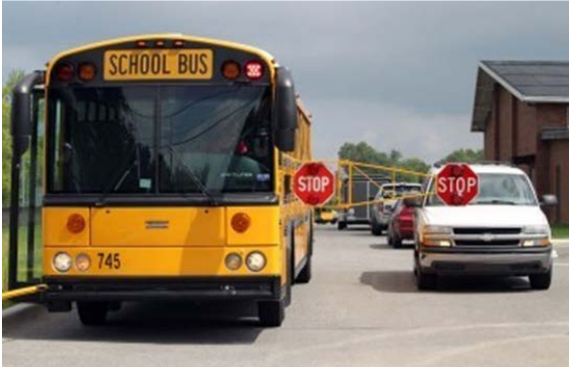
Figure 8. Extended stop arm with two stop signs on school bus.

To address motorists' failures to stop for school buses, extended stop arms have been designed to better communicate to oncoming drivers their responsibility to stop. Figures 8 and 9 show examples of extended stop arm systems. Pilot programs using extended stop arms have shown decreases in vehicles illegally passing stopped school buses. 66