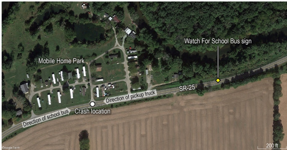
Figure 1. View of crash location on SR-25 in Rochester, Indiana.

On Tuesday, October 30, 2018, the 57-year-old male driver of a 72-passenger 2015 Thomas Built school bus, operated by Tippecanoe Valley School Corporation (TVSC), was driving his normal route. He had picked up three students at designated school bus stops and, about 7:12 a.m., was traveling north in the 4600 block of State Route 25 (SR-25) in Rochester, Fulton County, Indiana. At this location, SR-25 is a two-lane highway with a posted speed limit of 55 mph. A mobile home park is located on the west side of the roadway and an agricultural field is located on the east side. (See figure 1.) 1 There is no roadway lighting at this location. Conditions were dark, the sky was cloudy, and the roadway was dry.