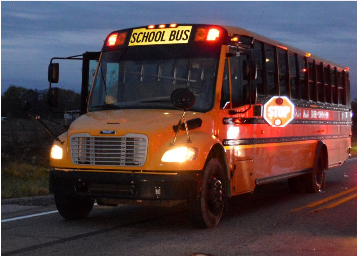
Figure 7. On-scene postcrash view of school bus with lights in operation.