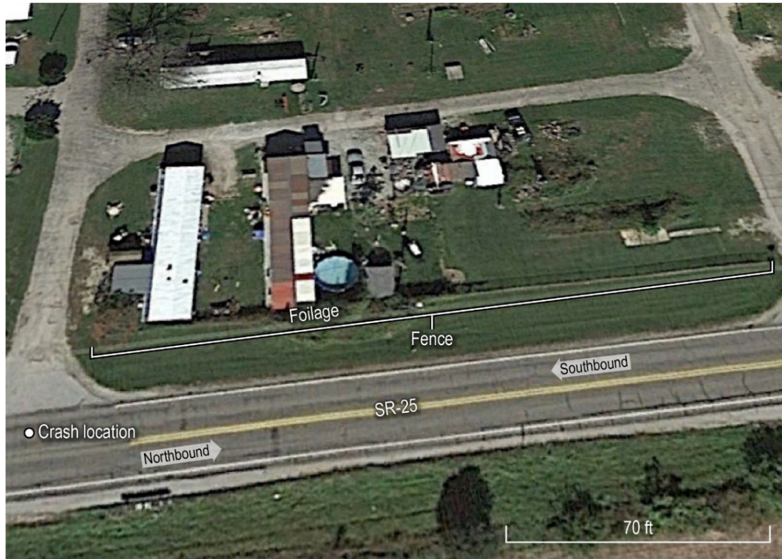
Figure 4. Crash location and SR-25 roadway.