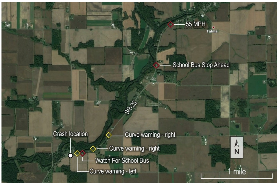
Figure 3. Southbound approach to collision site and relative locations of signage along SR-25.

With respect to highway signage, a Watch For School Bus sign is positioned about 868 feet north of the collision site. A School Bus Stop Ahead sign is positioned 9,706 feet north of the collision site. Curve warning signs are located 667 feet north of the collision site (left curve warning sign), 1,747 feet north of the collision site (right curve warning sign), and 3,355 feet north of the collision site (right curve warning sign). (See figure 3 for roadway and signage information.)